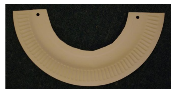
Figure 2: → Underside of rim, pierced for threading and ready for decoration